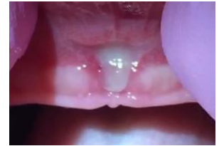
Lip at 1 week