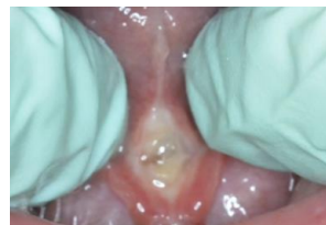
Tongue at 1 week